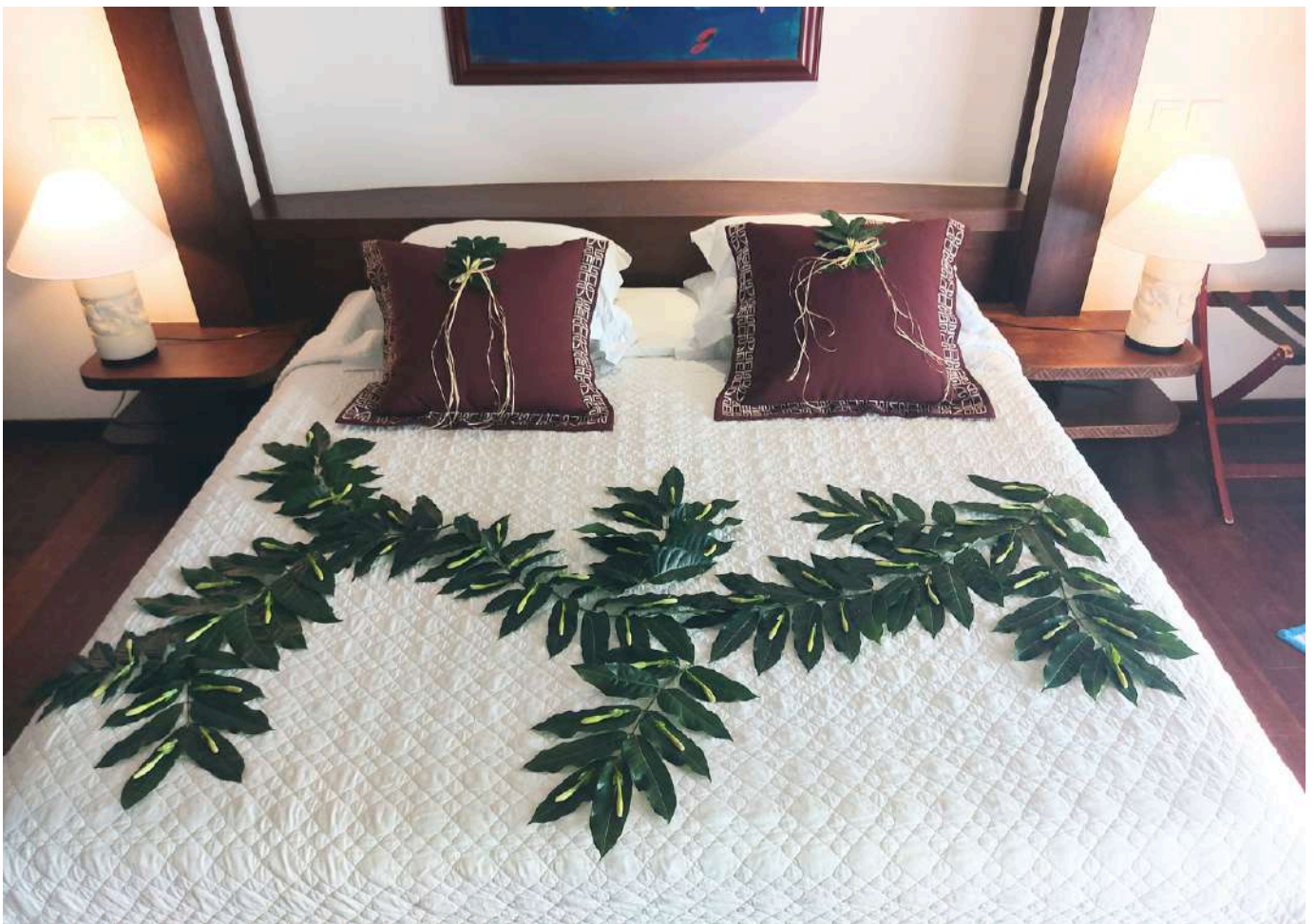
Example of floral decoration : Haere Mai