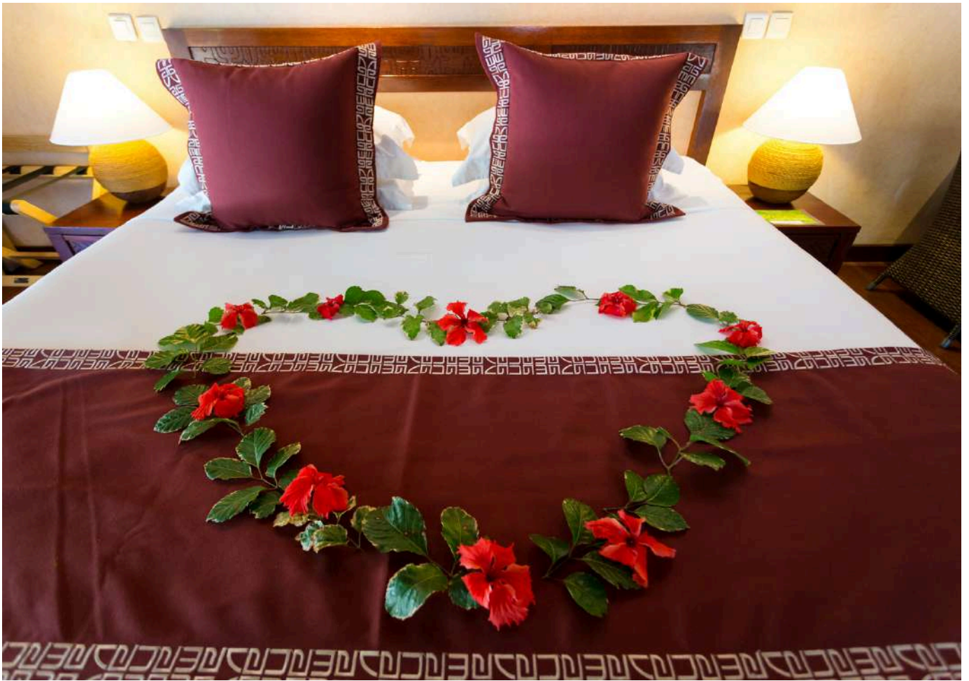
Example of floral decoration : Manava Caress